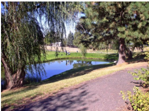
Pullman—the city of parks and paths

It is our hope that the information provided in this brochure will create a greater awareness of these contributions. We challenge others to participate in this worthwhile civic cause.