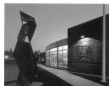
Shirrod Heritage Addition — Neill Public Library