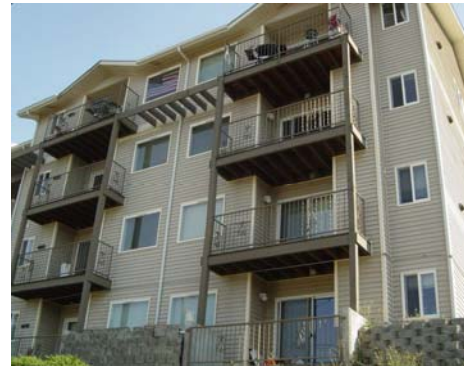
The proposed design review standards would apply to new construction related to all residential uses in the College Hill Core area.

number of College Hill stakeholders. The draft standards address the placement and design of new buildings, parking areas, walkways, and open space. They also set parameters for the appearance of new buildings, including walls, entryways, windows, roofs, foundations, and exterior materials. The planning department expects to conduct a meeting in October to solicit comments from stakeholders regarding these design review concepts. When this first draft of design standards has been refined appropriately, planning staff will present the document to the Planning Commission for review. Eventually, the proposed regulations will be submitted to the City Council for consideration.