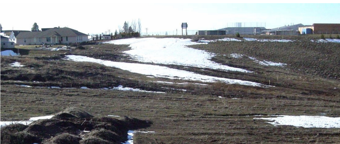
The site for the proposed church is currently vacant. High school facilities can be seen to the right in the background.

the following conditions: 1) all buildings and parking areas shall maintain a 15-foot setback from property lines; 2) a screen (consisting of a solid fence or wall plus sight-obscuring landscaping) shall be established around the perimeter of the property; and 3) the parking area shall be screened along the property line abutting Park View Drive with a landscaped hedge. Barring any appeals, the applicant is expected to act on this construction project within the next year.