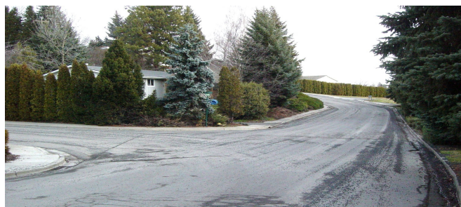
Multiple access routes are provided to subdivisions over time.

Your comments, questions and suggestions are always welcome.